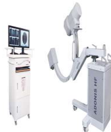
Figure 1: ADONIS C Arm Real Image

All ADONIS X-Ray Machines are approved by Atomic Energy Regulatory Board (AERB) for Radiation Safety. Our company deals with the manufacturing of X-rays machines and we distribute it within the whole world. ADONIS Mobile C-Arms are used for X-ray guidance during procedures in Orthopedics, Urology, and Cardiology, Neurology etc. for faster and more accurate Evaluation of surgical parameters. The ADONIS mobile C Arms are categorized into three categories: Platinum View, Gold View, and Diamond View.