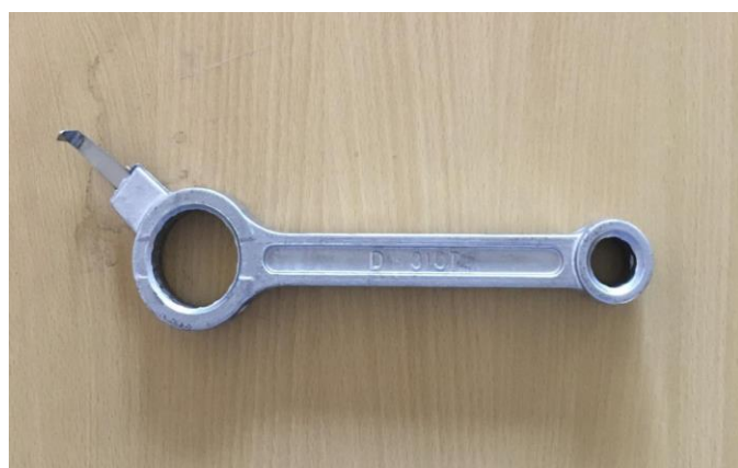
Fig -1: Connecting rod analysis specimen

Reinforcement is a technique which is designed to increase the probability of repeat behavior, in contrast with punishment, in which the goal is to decrease the probability of repeat behavior. In positive reinforcement, a pleasant stimulus is introduced to the situation as a reward, while in negative reinforcement, a negative stimulus is taken away as a reward. While negative reinforcement might sound strangely like punishment, it is important to note that rather than punishing behavior by introducing a negative stimulus, it is rewarding behavior by taking the unpleasant stimulus away.