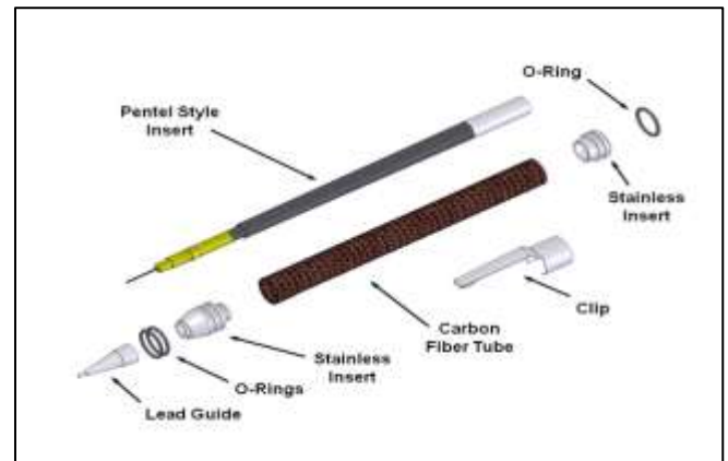
Figure 3 Mechanical Pencil

Mechanical pencil most commonly known as Lead Pencil or Pen pencil is popular product among students, artists, Designers or Engineers. It uses graphite lead of 0.3 mm, 0.5 mm and 0.7 mm which varies the line thickness. It first invented in 1565 along with time there are lot of advancements but there are some problems with its functioning which are not fixed which means there is chance of improvement.