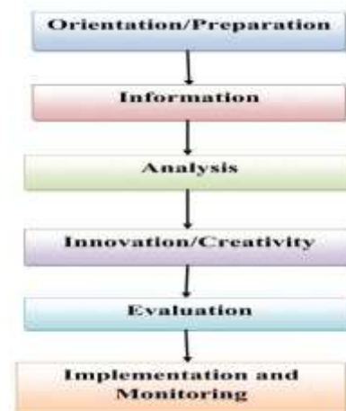
Figure 2 Value Engineering Phases

This phase is conducted at a location convenient to the owner and designer frequently at owners' premises near the project site it lasts for a minimum of 3 to maximum of 5 days with an agenda for the first meeting including from introduction to questions by the value engineering team members for the designer. After the designer's oral presentation with the question and answer period it is desirable for the owner and designer to escort the value engineering team on a brief site visit the team then process with the following basic job plan common to all Value Engineering includes following phases.