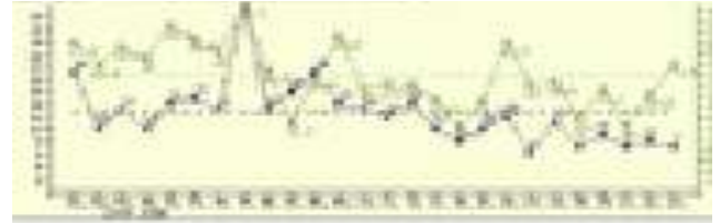
Figure 3: Traffic on the web

The graph that represents the traffic on the web is defined in the figure 3.0