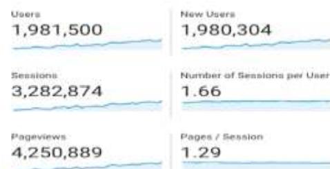
Figure 1.0: The factors of the web analysis

Various factors of the web analysis as shown in figure 1.0