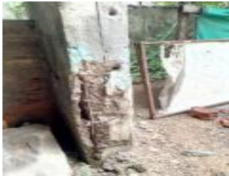
Fig -1: Reinforcement exposed, corrosion, cracks observed in Column.