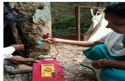
Fig -8 Half Cell Potentiometer Test.