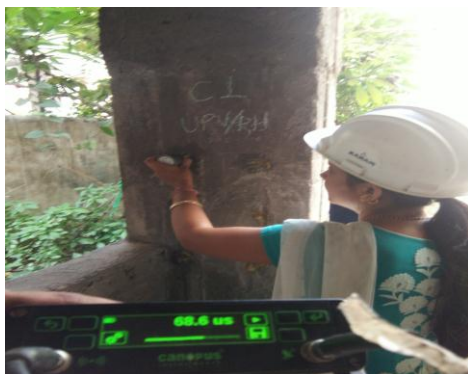
Fig -6 Ultrasonic Pulse Velocity Test.