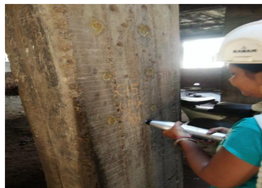
Fig -4: Rebound Hammer Test.