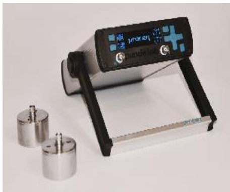
Fig -5 Ultrasonic Pulse Velocity Test Machine.