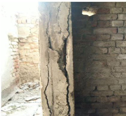
Fig -2: Reinforcement exposed, corrosion, cracks observed in Column.