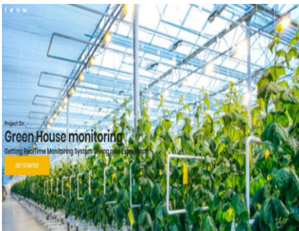
Figure 3. web page input window

We have developed the website of greenhouse monitoring system as shown in figure 10.1. This web browser displays a web page on a monitor or mobile device. On a network, a web browser can retrieve a web page from a remote web server. This web server is used access a private network such as a corporate intranet. The web browser uses the Hypertext Transfer Protocol (HTTP) to make such requests to the web server.