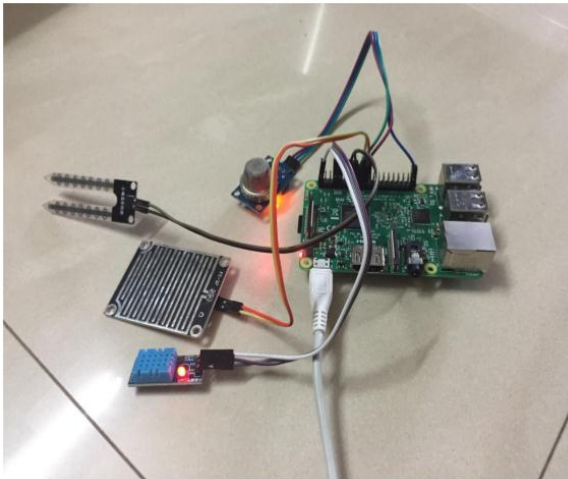
Figure 2. Hardware of the system

The main component of the hardware is Raspberry Pi. The sensors used are temperature sensor, humidity sensor, soil moisture sensor, rain detector sensor and smoke detector sensor. The sensors are used to measure the current environmental conditions. Readings at different intervals of time is observed. Temperature sensor is used to measure the present temperature of the atmosphere. Humidity is used to measure the content of moisture present in air. Soil moisture sensor measures the water content in the soil and supplies water if needed. Rain detector sensor is used to detect rainfall. Smoke detected sensor is used to detect the presence of gas in air, the led on the sensor glows as soon as the smoke is detected. As soon as smoke is detected the buzzer beeps.