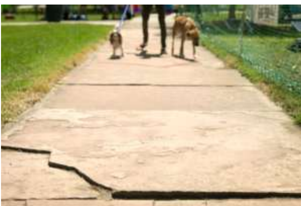
Figure.3 Expansion cracks

Excessive heat causes concrete to expand like a balloon. During this expansion of the concrete, it pushes against anything in its way (a brick wall or adjacent slab for