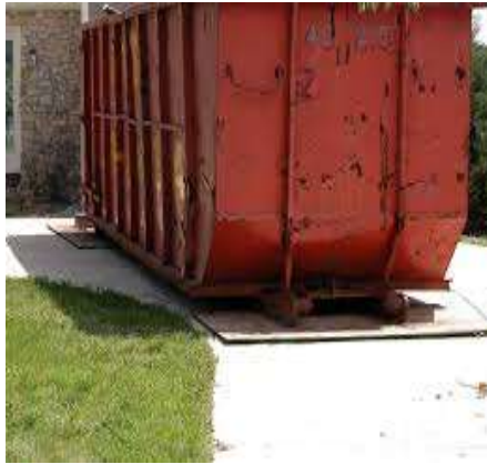
Figure.6 Cracks due to overloading