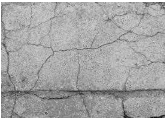
Figure.7 Cracks due to premature drying

There are 2 types of cracks brought on by premature drying. Cracking cracks which are too fine. Surface cracks which resemble shattered glass or spider webs. When the moisture on the top of a concrete slab is lost too quickly, crazing cracks are likely to appear. Crazing cracks are not a structural concern unsightly. During the concrete stamping process, which is a method of adding pattern or texture to concrete surfaces, crusting cracks typically happen. On windy or sunny days when the top of the slab gets dried out earlier than the bottom, the concrete top surface becomes crusty. When the stamp gets embedded, the surface gets pulled apart near the stamped joints and it causes smaller cracks around outside edges of the “stones”.