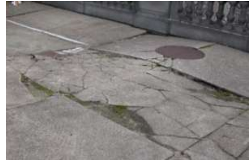
Figure.4 Heaving cracks

During cooler season when the ground freezes, then sometimes it lifts many inches before thawing and settling back down. This freezing and thawing cycle which caused the ground movement is a huge factor causing concrete cracking. If the slab is not at all free to move with the ground, then heaving cracks occurs.