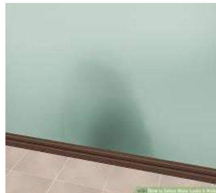
Figure.8 Discoloration on wall

When there is a leakage in the wall, obviously there is an discoloration that appears in the outer surface of the wall. Look at the sections where the surface of the wall is whether drywall, wallpapered or even wood when is slightly washed away or may have a lighter color than that of the surrounding area. The discoloration may have irregular shapes.