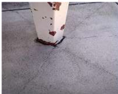
Figure.2 Plastic shrinkage crack

When concrete remains in its plastic state (before hardening), it is full of water. When that water is left from the slab, large voids are left behind between the solid particles. Thus the concrete became much weaker because of the empty spaces and are more prone to cracking, called “plastic shrinkage cracking”.