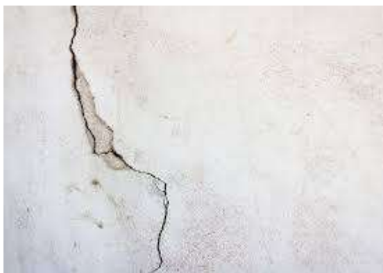
Figure.1 Seepage crack

The success of the repair activity depends on the identification of the root cause the deterioration of the concrete structure. When the causes are identified properly, satisfactory repairs can be done for the improvement of strength and durability, thus extending the life of the structure, is not difficult to achieve. Repair of the structure should be carried out as soon as the deterioration of the concrete is observed. When it is found by the various test that concrete is porous/ honey combed, it should be treated with pressure grouting, guniting is another way to rehabilitate the structure, in which a dense and firmly adhesive coating applied over the exposed surface.