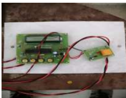
Fig -9: Controller circuit with relay switch

This control circuit was designed to automatically control car cabin temperature when temperature is increased. This system works when the vehicle in off condition for that we have separate battery for this system. This battery is charged by solar panel. Then battery is connected to microcontroller. The two temperature (inside and outside) sensor is connected to microcontroller and also thermoelectric cooler, fans are connected to micro controller. When temperature is increased in cabin inside temperature sensor sends signal to micro controller, then microcontroller turn on the thermoelectric cooler. When cabin temperature reach to ambient temperature (measure by outside temperature sensor) controller cut off power supply to thermoelectric cooler.