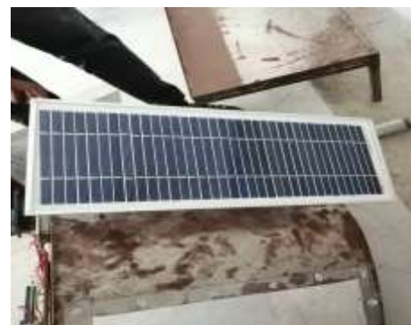
Fig -7: Solar Panel

This solar panel will produce power of about 12v, 10w connected to battery. When sunlight falls on solar panel it will generate DC electric power and recharge the battery.