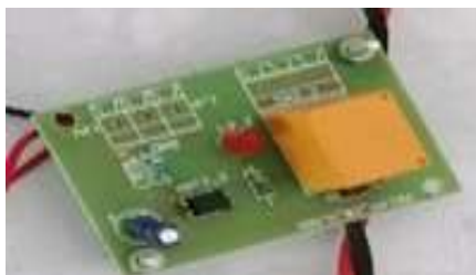
Fig -4: Relay

Relays are essential for automation systems and for controlling loads. Also, relays are the best way for galvanic insulation between high and low voltage portions of a circuit. There are hundreds of different relay types. Let's find out first how a relay operates. Before extending to the various types of relays, I will first explain what and how the basic relay operates. Each relay has two mechanical parts inside. The first one is the contact(s) of the relay. The contacts operate similarly to the contacts of a simple switch or pushbutton.