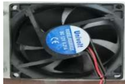
Fig -6: Fan

The fan exhausts the hot air formed inside the cabin through aluminium heat sink. On the other side the air from the cold side is sent into the cabin. Based on the calculation we used 12V 0.21A DC fan attached at both side of the heat and cold sink.