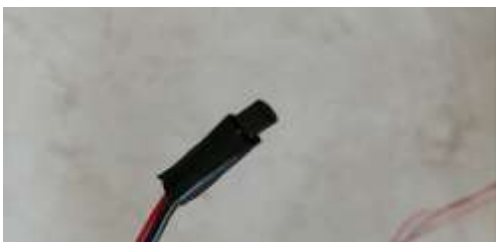
Fig -3: Temperature sensor

In this project we use LM35 Temperature sensor. The LM35 is one kind of commonly used temperature sensor that can be used to measure temperature with an electrical o/p comparative to the temperature (in °C). It can measure temperature more correctly compare with a thermistor. This sensor generates a high output voltage than thermocouples and may not need that the output voltage is amplified. The LM35 has an output voltage that is proportional to the Celsius temperature. The scale factor is .01V/°C.