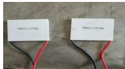
Fig -2: Thermoelectric cooler

Thermoelectric cooling uses the Peltier effect to create a heat flux between the junction of two different types of materials. A Peltier cooler, heater, or thermoelectric heat pump is a solid-state active heat pump which transfers heat from one side of the device to the other, with consumption of electrical energy, depending on the direction of the current. Such an instrument is also called a Peltier device, Peltier heat pump, solid state refrigerator, or thermoelectric cooler (TEC). It can be used either for heating or for cooling, [1] although in practice the main application is cooling. It can also be used as a temperature controller that either heats or cools.