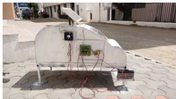
Fig -11: Proposed design of car cabin with circuit

The above figure shows the layout of the Controller Circuit. From the solar panel the battery is getting charged. Microcontroller is that which controls the total working of the circuit. Two temperature sensors are used to check the temperature, one is used to check the outside temperature and other sensor is used to check the inner temperature of the car cabin. Another device named Thermoelectric cooler is used to cool down the car cabin temperature by desipating the heat from the heat sink to cold sink which is connected to controller circuit.