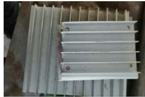
Fig -5: Aluminium heat sink

An Aluminium heat sink is a passive heat exchanger that transfers the heat and cold generated by an thermoelectric cooler device to a fluid medium, often air, where it is dissipated away from the device, thereby allowing regulation of the device's temperature at optimal levels.