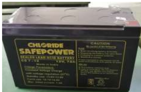
Fig -8: Battery