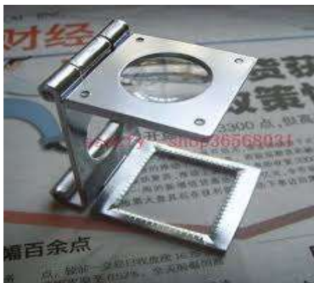
FIG 1 MAGNIFYING GLASS

The existing system for thread counting in woven fabric is use of magnifying glass and a teasing needle.