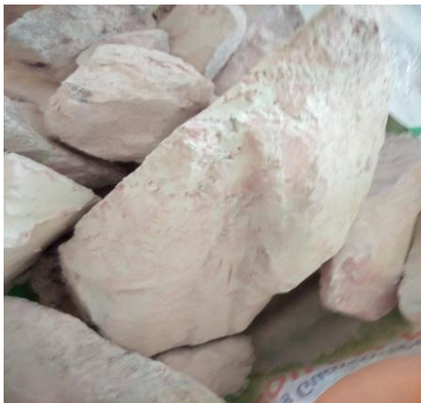
Fig -1: Thonnakkal clay