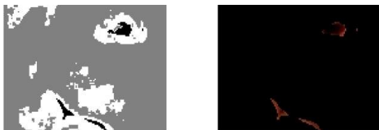
Fig-6.(f) K means result

system installed with MATLAB starter application and CPU, GPU application.