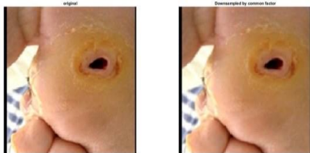
Fig-1(a) Input and downsapled image

The mean shift algorithm only segment the original image into various homogeneous regions based on similar features, but the object recognition is needed for accurate wound boundary detection that can be easily understood by the users. The wound boundary detection method has three assumptions. i) The foot image contains little irrelevant background information. ii) The skin on the sole of the foot is nearly uniform color feature. iii) The foot ulcer is cannot be located on the edge of foot outline. The RYB model is one of simple assessment model to evaluate wounds. The red yellow and black or mixed tissues represent the different phases of wound healing process. The red tissue represent inflammatory phase, proliferation or maturation phase. yellow tissues imply infection phase and tissue contains slough. Black tissue imply necrotic tissue phase.