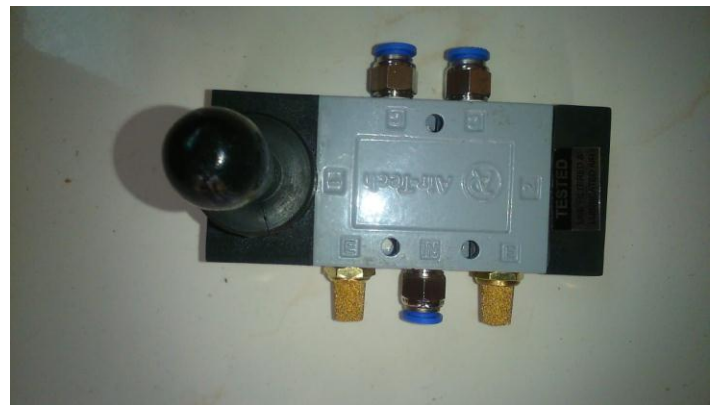
Fig -2: solenoid valve

If pneumatic cylinder are chosen to be used for the project, a device would be need to control when air need to enter and exit the cylinder. To do this a solenoid valve is going to be need for the project. A solenoid valve is electromechanically operated valve, which is controlled by an electric current that flow a solenoid and switches the solenoid from on to off. In the case of this project it will be an air valve solenoid which will turn air on and off when need to operate a component for the project.