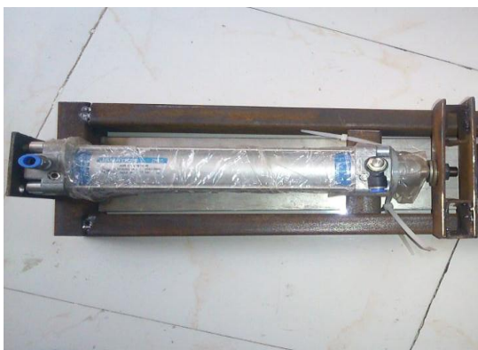
Fig -1: Double acting cylinder

A double-acting cylinder has a two-port on the cylinder, which is located at both ends of the cylinder. With the double-acting cylinder having two airports this would allow the cylinder to move in both extend and retract directions. Basically only one port of the cylinder is pumped with compressed air and the other port is used as an exhausted. The double-acting cylinder can also be used like a single-acting cylinder as long as there is no spring return is required. The only down fall to a double-acting cylinder is that air compressed going through the tables is not calculated right, and that may cause the piston rod to be more vulnerable to bucking and bending. Max Power Transmitting Capacity 7 bar. It needs 12volts dc supply for actuation.