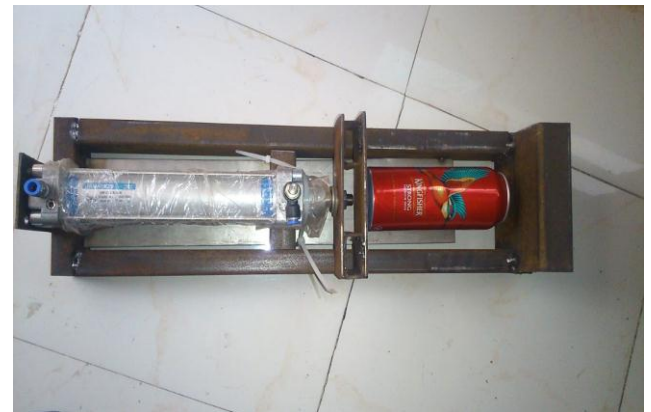
Fig-6. Design of can crusher

The material used for the cylinder is aluminum, which is having specification of 50 diameter, 100mm in length and permissible load (ft) 180N/mm 2 . We have selected 50mm diameter cylinder so as to get proper force intended on can and it get crushed ,here is the calculation carried out:-