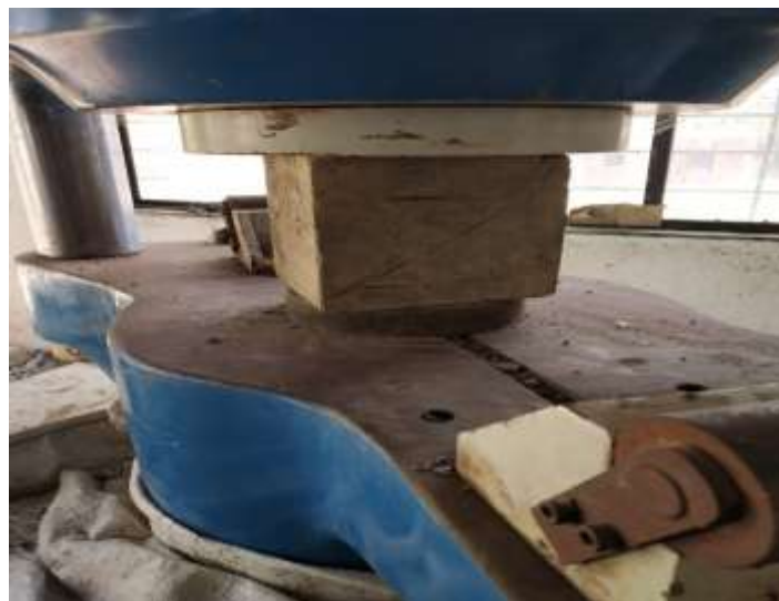
Fig -1: Compressive strength test on column