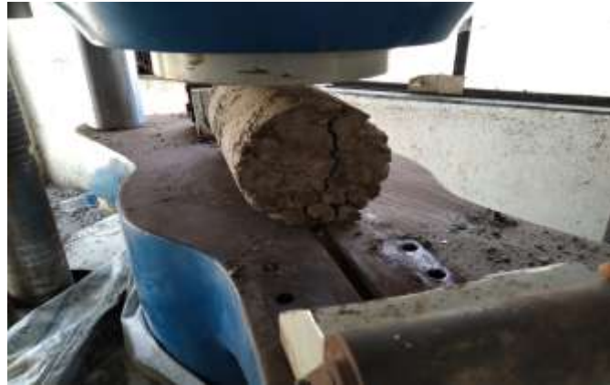
Fig -2 :Split tensile strength test on column