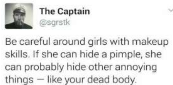
Fig. 2: Sample tweet

Twitter a social media platform consist of various kind of tweets with different content. These kind of tweets need to be taken care of in the process of sentiment analysis. The fig. 2 is an example of the random tweet available in Twitter