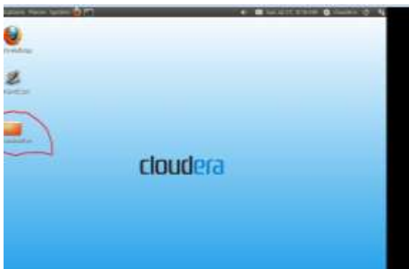
Fig 6: Cloudera os

Data analysis is the prominent part of our activity. Big data involves storing large amount of data, analyzing and retrieving them according to our needs. Data analysis are of two types qualitative and quantitative analysis. Qualitative analysis sees the color and some texture of data whereas Quantitative analysis seeks for the numbers. Here we will analyze the temperature, water level, PH of the water level, UV rays of the sun that falls on the plant.