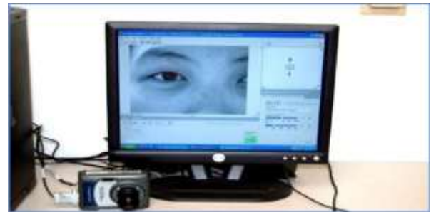
Fig-3. NI Smart Camera and Eye Tracking System

processor and saved to spreadsheet for future reference. These coordinates are computed as the center of the rectangle bounding the detected eye.