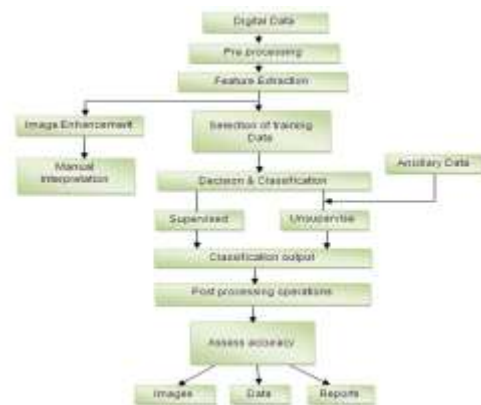
Fig 1:Architecture of System

In the System architecture the Process of Images include Pre-processing, feature extraction and then manually we can changes the images with it's properties such as Iso, Expeture, Aperture.etc