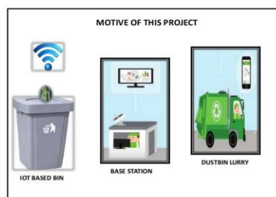
Fig-1:IOT based bin

The basic idea in this project is to design a smart garbage detection system which would automatically notify the officials about the current status of various garbage bins in the city, with the real time monitoring capabilities, under remote controlled IOT technique, which is depicted in fig 1.