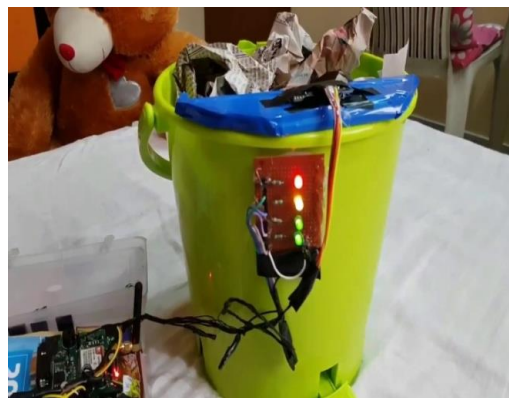
Fig-5: Sensor indication.

This system is implemented with the help of IOT module that act as interfaced between human and the garbage. Once the user opens the application, it get registered using his name and password. In the page, if entered information matches the data in database then login is successful. User would be able to access the information like status and location of the bin. When the bin is filled, then the red LED is lit up and the green LED for empty. This information is also represented on the web server and is stored in the database.