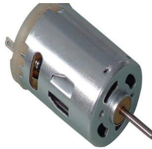
Fig-4: Dc motor: