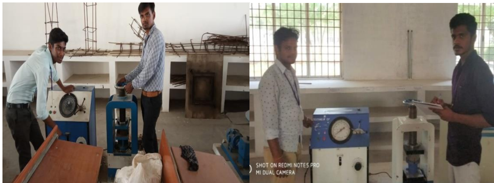
Figure 5.1 compressive test