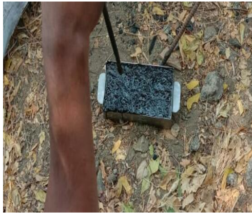
Figure 4.2 Casting and compaction