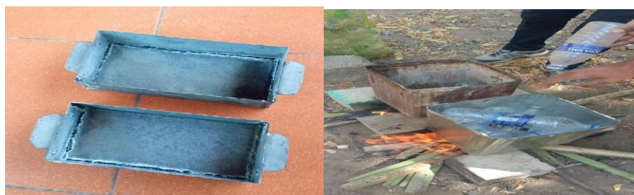
Figure 4.1 Heating and Adding

Plastic wastes are heated in a metal bucket at a temp of above 150°. As a result of heating the plastic waste melt. The materials quarry dust, aggregate and other materials as described in previous chapter are added to it in right proportion at molten state of plastic and well mixed. The metal mould is cleaned through at using waste cloth. Now this mixture is transferred to the mould. It will be in hot condition and compact it well to reduce internal pores present in it. Then the blocks are allowed to dry for 24 hours so that they harden. After drying the paver block is removed from the mould and ready for the use.