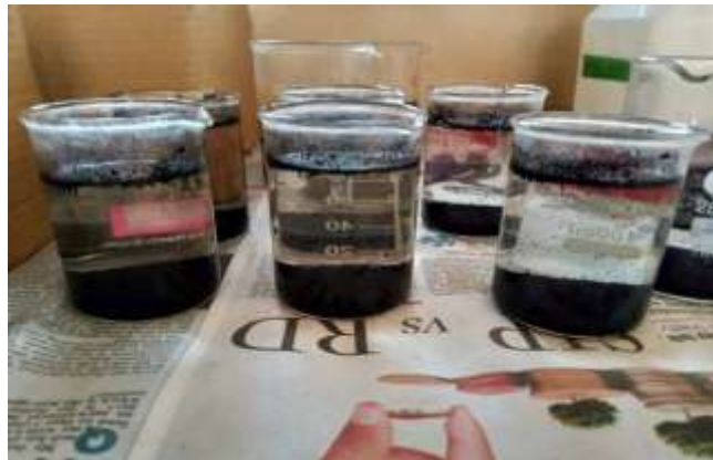
Fig.2 Water samples coagulation with rice husk char