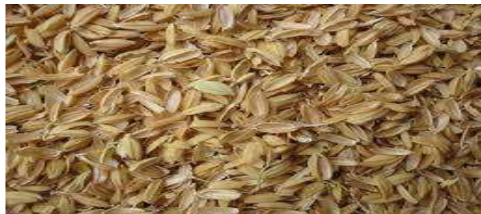
Fig.1 Rice husk

Differences in varietal characteristics have significant effects on the chemical properties of rice husk the basic properties of rice husk are as follows: