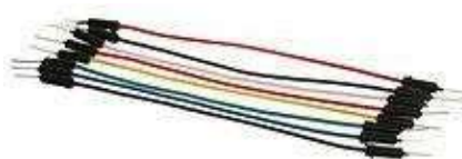
Fig-5: Jump wires

A modern solderless breadboard consists of a perforated block of plastic with numerous tin plated phosphor bronze or nickel silver alloy spring clips under the perforations. The clips are often called tie points or contact points. The number of tie points is often given in the specification of the breadboard. The spacing between the clips (lead pitch) is typically 0.1 in (2.54 mm). Integrated circuits (ICs) in dual in-line packages (DIPs) can be inserted to straddle the centerline of the block. Interconnecting wires and the leads of discrete components (such as capacitors, resistors, and inductors) can be inserted into the remaining free holes to complete the circuit. Where ICs are not used, discrete components and connecting wires may use any of the holes. A breadboard is utilized to build and test circuits expeditiously afore finalizing any circuit design. The breadboard has many apertures into which route components like ICs and resistors can be connected. A typical breadboard that includes top and bottom power distribution rails is shown below figure 4. Jump wires are generally used to establish connectivity with bread board as shown in figure 5.