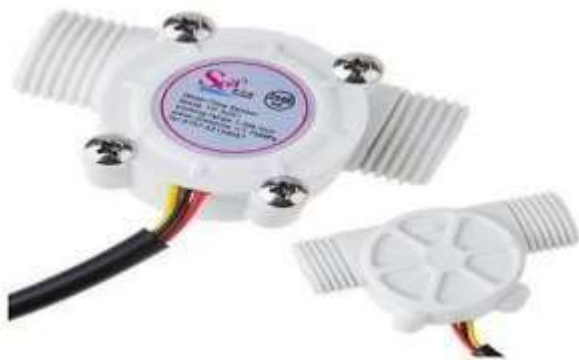
Fig-3: Flow sensor