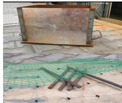
Figure 3: Collected Materials

Soil nailing through existing concrete or masonry structures such as failing retaining walls and bridge abutments to provide long term stability without demolition and rebuild costs.