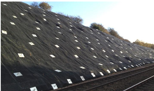
Figure 2: Wire mesh covered on a slope