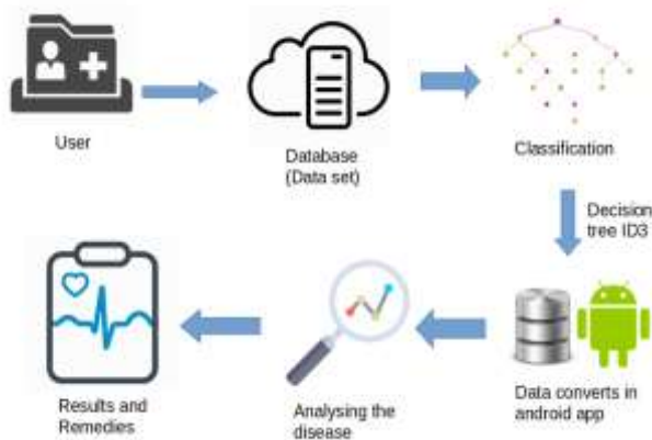
Figure 4.1 : Architecture Diagram

The above architecture in figure 4.1 shows how the system process is carried out. Where the user choose the symptoms using the developed mobile application. Then the symptoms will be passed to the decision tree after predicting the disease then it will scan the database to find the corresponding remedy to the disease. Then it will be shown in the user interface of mobile application.