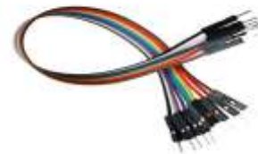
Fig. : Jumper wires.

Jumper wires are simply wires that have connector pins at each end, allowing them to be used to connect two points to each other without soldering. Jumper wires are typically used with breadboard and other prototyping tools in order to make it easy to change a circuit as needed. Used for connecting hardware components.