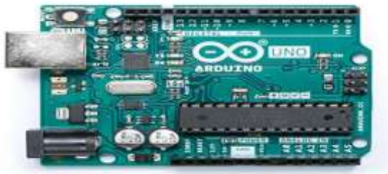
Fig. : Arduino board.

taking the information captured by the sensors and to send that information to the cloud.