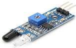
Fig. : Infrared sensor.

An infrared sensor is an electronic device, that emits in order to sense some aspects of the surroundings. An IR sensor can measure the heat of an object as well as detects the motion. This sensor will detect the vehicle which is parked in no parking. This will be done only when the vehicle is parked more than 5minutes.