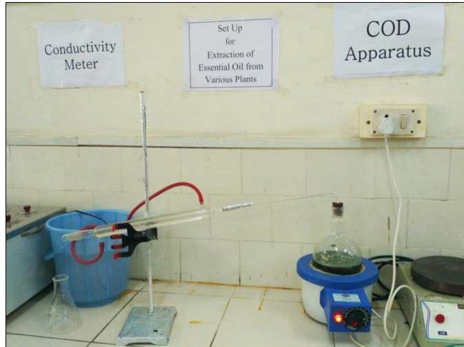
Fig -1: Laboratory experimental setup

draining free water on the surface of the leaves, then weight 300 gms of grass and chopped in to a different pieces of various size of about 2.5 cm, 2.0cm, 1.5cm and 0.5cm length on chopping board with a sharp edged knife.