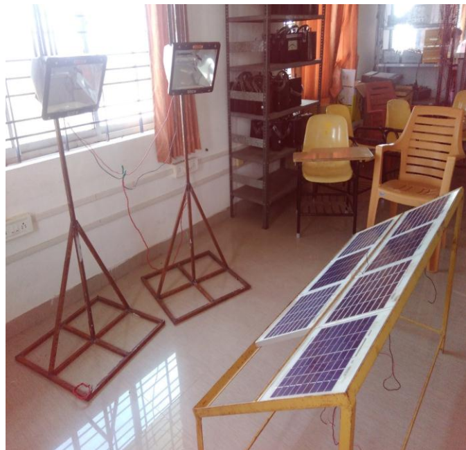
Fig – 2: STC SETUP

circuit voltage (Voc), Short circuit current (Isc), Maximum power output voltage (Vmp), Maximum Power output current (Imp) and efficiency depends upon the area of the panel. This readings are taken at this time irradiation (1000W/m 2 ) and Cell temperature (25 o c) is constant.