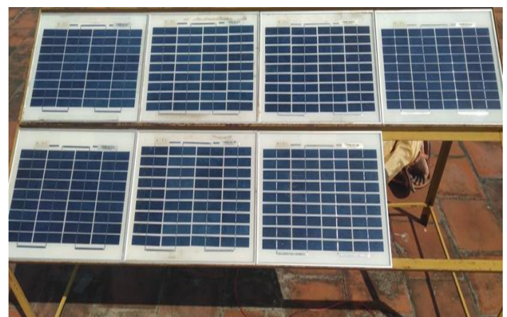
Fig – 3: NTOC SETUP