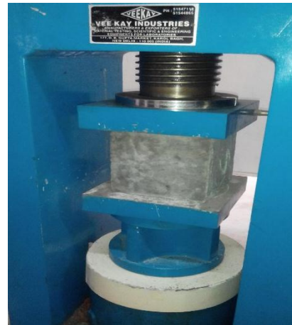
Fig -2: Cube Before fracture