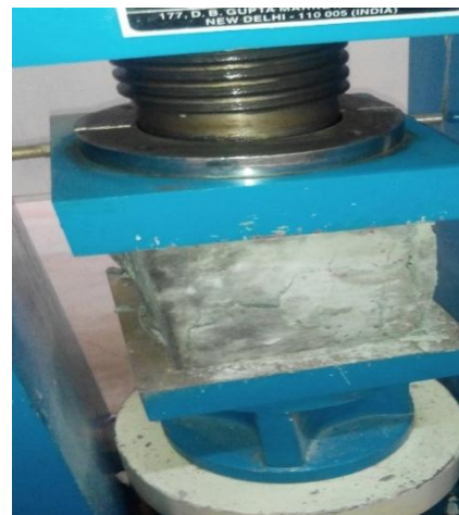
Fig -3: Cube After fracture

The different readings revolve the fact that the absolute maximum value is obtained at 28 days for the specified ratio of 20% of the bakelite plastic admixture. There characteristics influence in the concrete mix is seen in the above table.