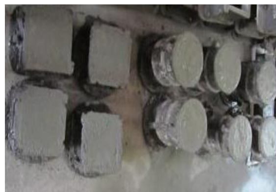
Fig -1: Casting of cylindrical vassal & Cube.

The methodology of the Bakelite plastic concrete is that since Bakelite is the thermosetting plastic which means whenever the temperature is increase then the Bakelite plastic is become hard and maintained the strength of the concrete. In this research we replace the Bakelite plastic waste as a coarse aggregate with the partial replacement with 5%,10%,15% and 20%. After the replacement we prepare the M20 grade of the concrete and check the compressive strength and tensile strength of the concrete.