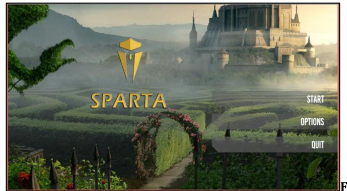
ig 1- Main Menu