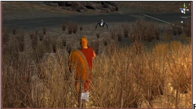
ig 4- Player