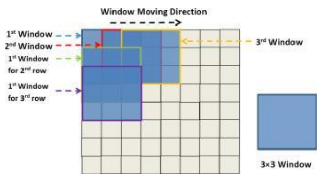
Fig -1: Sliding window based method