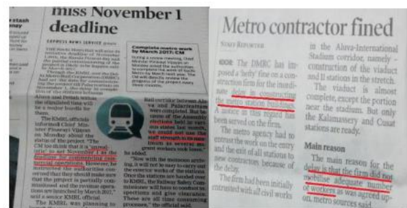
Fig.2 Newspaper clippings on Kochi Metro

For the conducting the analysis the factors were identified and the external stakeholders were also identified and were grouped into four different groups. Concerns of stakeholders are generally different and requirements of different stakeholders are as a rule always diverse. Hence first various stakeholders with common need were categorized into four different groups: Land Owners and Local Residents, Regulatory Agencies (Special Tahasildar Office & Choornikara Panchayat), Political Parties & Environmentalists Public Works Department Ernakulam & Contractors. Separate questionnaires were prepared for each group of stakeholders and each of them were analysed separately to get more clarity of the factors that actually effect the project time. Stakeholders views about the project was evaluated on a five point Likert scale (1 = Very slight impact and 5 = Very high impact).