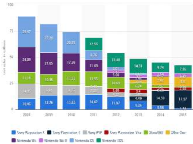
Chart -2: Sales Figures for Modern Consoles