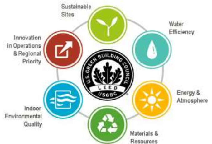
Figure 1-LEED Credit Categories

considered to be one of the most successful green building rating systems in the world because of its early market penetration and adoption by professionals. Since the CII-Godrej GBC achieved the prestigious LEED rating for its own centre at Hyderabad in 2003, the Green building movement has gained tremendous momentum. The Platinum rating awarded for this building sparked off considerable enthusiasm in the country. This rating system is based on accepted energy and environmental principles and strikes a balance between known established practices and emerging concepts. It is performance oriented, wherein credits are earned for satisfying criteria addressing specific environmental impacts inherent in the design and construction. Different levels of green building certification are awarded based on the total credits earned. The system is designed to be comprehensive in scope, yet simple in application. The specific credits in the rating system provide guidelines for the design and construction of buildings of all sizes in both the public and private sectors. The intent of LEED 2011 for India is to assist in the creation of high performance, healthful, durable, affordable and environmentally sound commercial and institutional buildings.