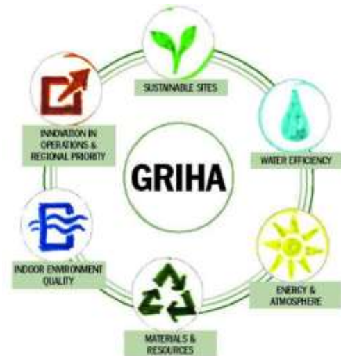
Figure 2-GRIHA Credit Categories

GRIHA was developed as an indigenous building rating system, particularly to address and assess non-air conditioned or partially air conditioned buildings. GRIHA has been developed to rate commercial, institutional and residential buildings in India emphasizing national environmental concerns, regional climatic conditions, and indigenous solutions. GRIHA stresses passive solar techniques for optimizing visual and thermal comfort indoors, and encourages the use of refrigeration-based and energy-demanding air conditioning systems only in cases of extreme thermal discomfort. GRIHA integrates all relevant Indian codes and standards for buildings and acts as a tool to facilitate implementation of the same.