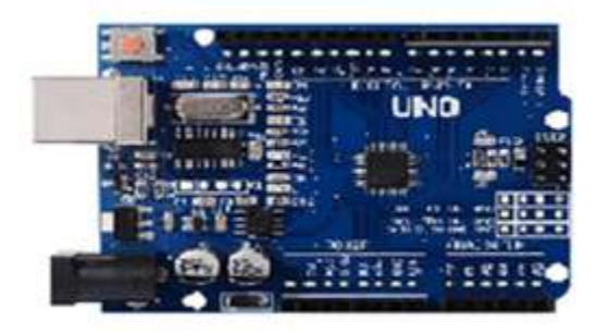
Fig -5.3: Arduino

Arduino UNO is a microcontroller board based on the AT mega 328. It has 14 digital input/output pins of which 6 can be used as PWM output, 6 analog inputs, a 16 MHZ. ceramic resonator, a USB connection, a power jack, ICSP header and a reset button. It contains everything needed to support the microcontroller; simply connect it to a computer with a USB cable or power it with an AC to DC adapter or battery to get started. The arduino comprises of 28 pins, where there 20 I/O pins. There are 14 digits pins and 6 analog pins. Here in this system all the respective sensors are connected to the analog pins of arduino. The analog pins A0, A1, A2, A3, A4, and A5 from port B of arduino are used for interfacing with the sensors. The digital pins (2, 3, 4, 5, 6, 7 and 8) ports C of arduino are used here to connect to the data lines of respective LCD display. The power supply of 5V is supply to the arduino through the USB cable.