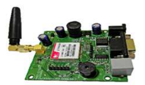
Fig -5.2: GSM module

Volume: 06 Issue: 02 | Feb 2019 www.irjet.net