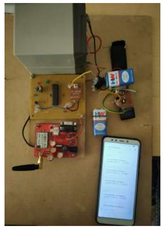
Fig -4.0: Prototype Model

Finally thealert message"I am in danger "or "a woman is in danger" along with the Latitudinal and longitudinal location is sending to the registered contact number. This activation of sensor and buzzer traces the location of victim using GPS and the help of GSM 800L used sends the message of location to the corresponding contacts with a 10 seconds delay.