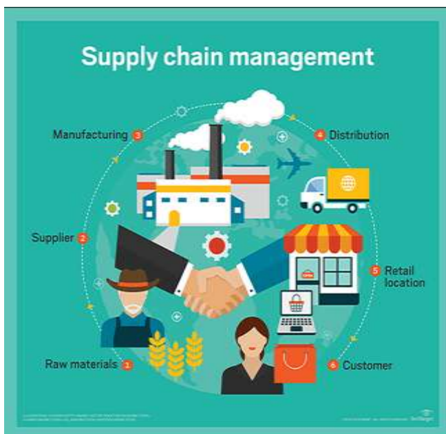
Fig -1: Supply chain management

Supply chain management is the management of the flow of goods and services from point of origin to point of consumption. It involves the domains of raw material, purchasing, inventory, warehousing, logistics, forecasting, hedging and finished goods. Supply chain is a network of entities, directly or indirectly linked.