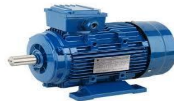
Fig 1: Three phase Induction Motor

Association) motors of the same size. To effectively evaluate the benefits of high-efficiency electric motors, we must define "efficiency". For an electric motor, efficiency is the ratio of mechanical power delivered by the motor (output) to the electrical power supplied to the motor (input). Efficiency = (Mechanical Power Output / Electrical Power Input) x 100%. Thus, a motor that is 85 percent efficient converts 85 percent of the electrical energy input into mechanical energy. The remaining 15 percent of the electrical energy is dissipated as heat, evidenced by a rise in motor temperature.