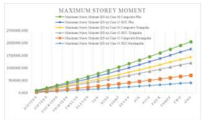
Graph 3 – Comparison of Maximum Storey Moment

From the comparison of maximum storey Moment for Rectangular, Triangular & Plus plan the following results has been derived