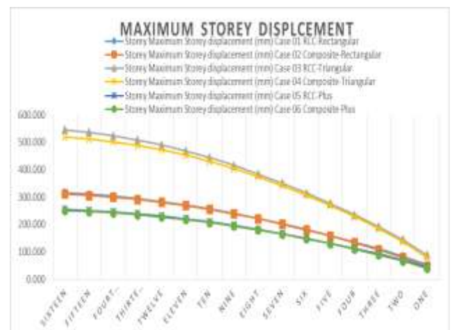
Graph 1 – Comparison of Maximum Storey Displacement for all cases

From the comparison of maximum storey displacement for Rectangular, Triangular & Plus plan the following results has been derived