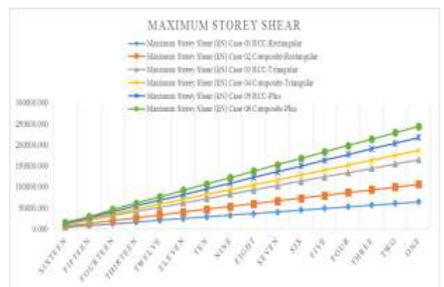
Graph 2 – Comparison of Maximum Storey Shear for all cases

From the comparison of maximum storey Shear for Rectangular, Triangular & Plus plan the following results has been derived