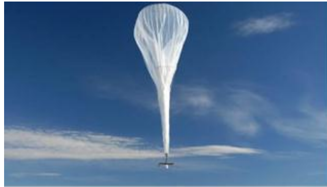
Fig.2.2 New Zealand

On 28 July 2015, Google signed an agreement with officials of Information and Communication Technology Agency (ICTA)