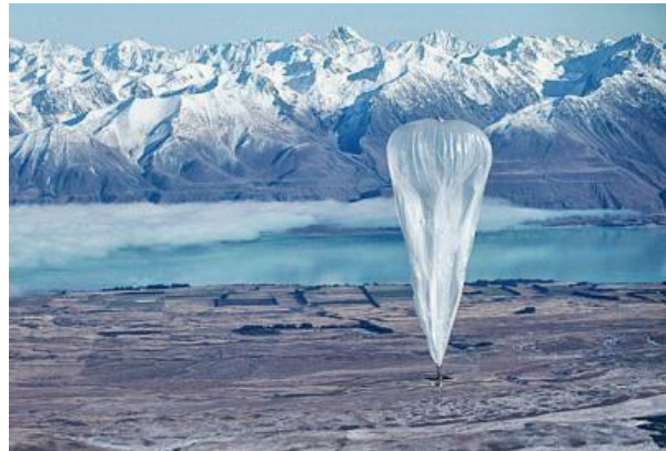
Fig 3.1. Balloon in Stratosphere