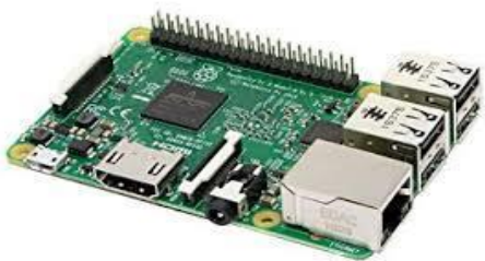
Fig - 3.3: Raspberry Pi[5]

Raspberry Pi: It is the Micro processor or a small computer. It consists of RAM, Processor unit, input ports, output ports, graphics card and also SD card. It is designed to work on linux as well as on windows platform. It can be operated with SSH, or use FTP to transfer the files. It has 1GB RAM. It uses python language for coding. It also provide camera port, USB connections etc.