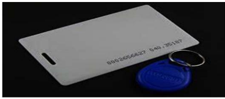
Fig - 3.1 Passive RFID tag[11]

RFID Reader: RFID reader is used to read as well as write the data onto the tags. Tag needed come in the range of reader to retrieve data from it.