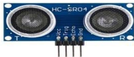
Fig - 3.4: Ultrasonic Sensor[5]

Ultrasonic sensor: Ultrasonic sensors measure distance by using ultrasonic wave and receives the wave reflected back from the target. It measure the time required during the emission and reception of the waves to calculate the distance. The device it self work as emitter and receptor. In proposed system it is used to detect the object or the obstacles face by the VIP.