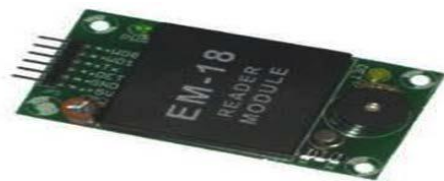
Fig - 3.2: RFID reader [11]

RFID Reader: RFID reader is used to read as well as write the data onto the tags. Tag needed come in the range of reader to retrieve data from it.