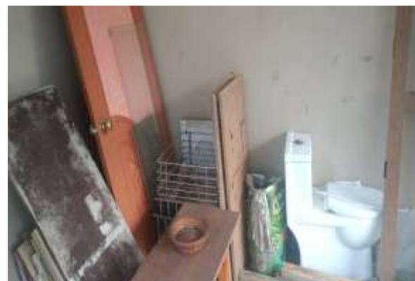
Fig.7. Remove all the furniture in the house