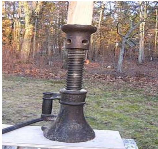
Fig.2. hydraulic jack