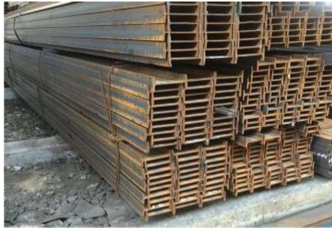
Fig.4. Channel beams