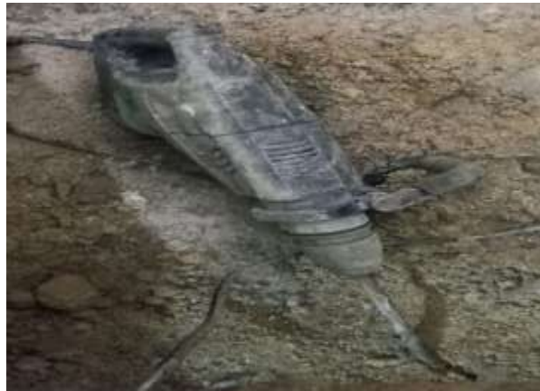
Fig.6. drilling machine