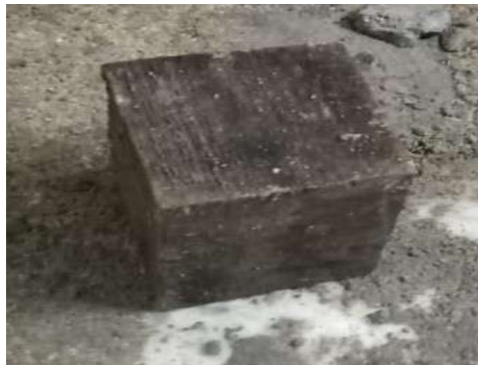
Fig.3. Wooden block

Wood has been used as a building material for thousands of years in its natural state. Today, engineered wood is becoming very common in industrialized countries. Wood is a product of trees, and sometimes other fibrous plants, used for construction purposes when cut or pressed into lumber and timber, such as boards, planks and similar materials. It is a generic building material and is used in building just about any type of structure in most climates. Wood can be very flexible under loads, keeping strength while bending, and is incredibly strong when compressed vertically. There are many differing qualities to the different types of wood, even among same tree species. This means specific species are better suited for various uses than others. And growing conditions are important for deciding quality.