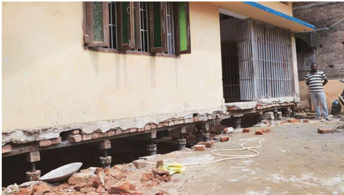
Fig.8. Excavate around the foundation

supports. At first the excavation is done near the walls for the application of the jacks, the jacks are applied below the ground beam or supports of steel beams.