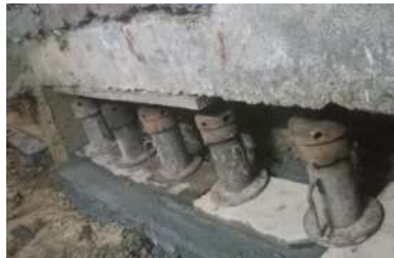
Fig.9. Raising house with jacks