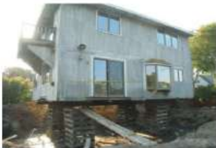
Fig.1. Building is protected against all forms of Natural disaster