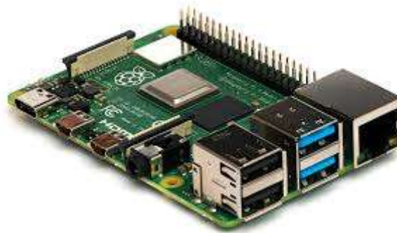
Fig: Raspberry pi

What's more, the Raspberry Pi has the ability to interact with the outside world, and has been used in a wide array of digital maker projects, from music machines and parent detectors to weather stations and tweeting birdhouses with infrared cameras. We want to see the Raspberry Pi being used by kids all over the world to learn to program and understand how computers work.