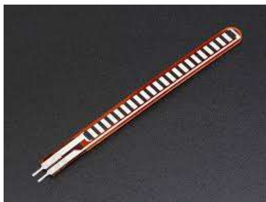
Fig: Flex Sensor

This flex sensor is a variable resistor like no other. The resistance of the flex sensor increases as the body of the component bends. Sensors like these were used in the Nintendo Power Glove. They can also be used as door sensors, robot whisker sensors, or a primary component in creating sentient stuffed animals. The Flex Sensor patented technology is based on resistive carbon elements. As a variable printed resistor, the Flex Sensor achieves great form-factor on a thin flexible substrate. When the substrate is bent, the sensor produces a resistance output correlated to the bend radius—the smaller the radius, the higher the resistance value. Spectra Symbol has used this technology in supplying Flex Sensors for the Nintendo Power Glove, the P5 gaming glove