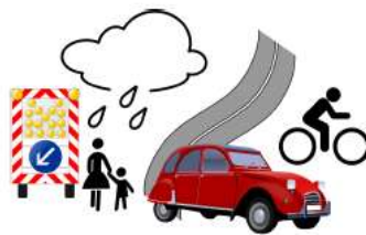
Fig 4. Environment [2]