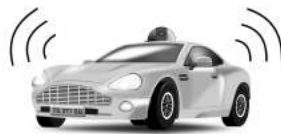
Fig 1: s-car [2]