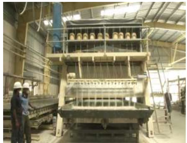
Fig.03 GFRG panel casting table