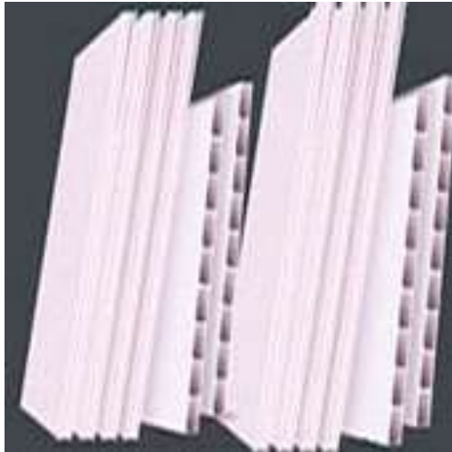
Fig.01 GFRG Panel