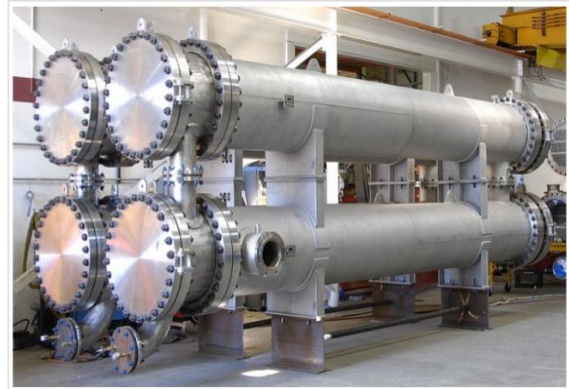
Fig.1: Stack Pipe Heat Exchanger [2]

Heat transfer equipment is defined by the function it performs in a process. The purpose of any such device is to maximize the heat transferred between the two fluids. However, the problem that occurs is the parameters that increase the heat transfer also increase the pressure of the fluid flowing in a pipe which increases the cost of pumping the fluid. S.P.Kamble [19]. Therefore, a design that increases the heat transferred, but at the same time can keep the pressure drop of the fluid flowing in the pipe to the permitted limit, is very necessary. A common problem in industries is to extract the maximum heat from the utility stream emanating from a particular process and to heat a process flow.