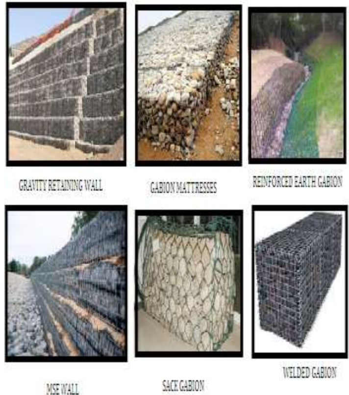
Fig -1: Types of Gabion Walls.