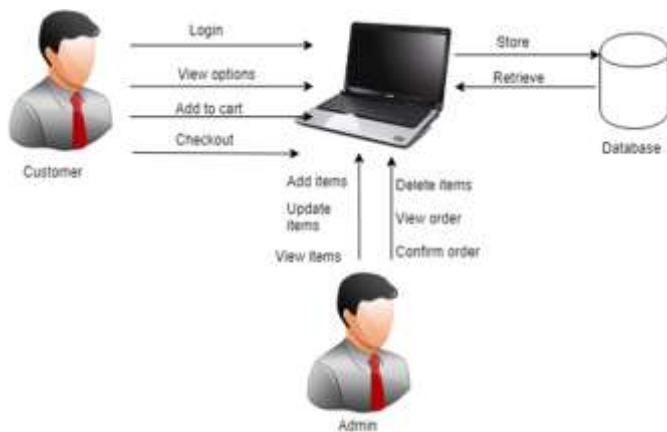
Fig-1 System Architecture

Database: It will contain all the details of registered users, all the categories of food items, items details like:-Item Id, Item Name, Item Price, Item Quantity. Then order details that has been placed by the user will be displayed to Admin. The admin will able to view the session ID, registered user id, date of order, time of order, item name, item price, item quantity, whether the order is according to per plate or per kg, item image and order status i.e. whether the order is delivered or in the queue to be delivered. The Cart Details will also be stored in the database once the user click on Add to Cart