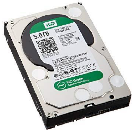
Fig.2. 1.5 TB Hard disk

1 TB = 1000000000000bytes = 10 12 bytes = 1000gigabytes.