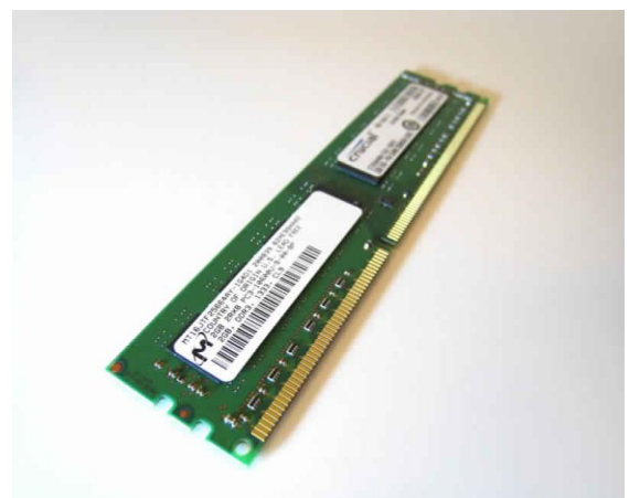
Fig.3. DDR3 RAM

DDR3 RAM is similar to DDR2 RAM, but it uses roughly 30% less power and can also transfer data twice as fast. While DDR2 memory can only transfer data at up to 3200 MBps (megabytes per second), DDR3 memory also supports maximum data transfer rates of 6400 MBps. This means computers with DDR3 memory can transfer data to and from the CPU much faster than computers with DDR2 RAM. The faster memory speed prevents bottlenecks, especially when processing data is large. Therefore, if two computers have the same processor clock speed, but different types of memory, then the computer with DDR3 memory may perform faster than the computer with DDR2 memory.