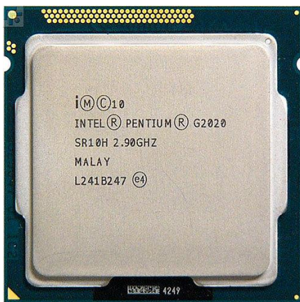
Fig.1. Intel Pentium g2020 processor

Intel Pentium G2020 is a processor of the Ivy Bridge series with two cores which are clocked at 2.9GHz. It also have an integrated Intel HD Graphics card with a base frequency of 650MHz. This processor also offers an impressively low power input, while sustaining a power output values which are similar to 3GHz processors of the Sandy Bridge generation. The G2020 is also incredibly cheap in price, for the stellar performance it offers, and is capable of sustaining at most three monitors and playing newer generation games with zero lag, making it perfect for enthusiast and pro gamers who are looking for an inexpensive, but fast and smooth processor.