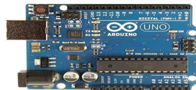
Fig.1 Arduino uno

The Arduino Uno is a microcontroller board based on the ATmega 328. The Arduino Uno can be powered via the USB connection or with an external power supply. The power source is selected automatically. The Arduino Uno has a number of facilities for communicating with a computer, another arduino or other microcontrollers. The Arduino software includes a serial monitor which allows simple textual data to be sent to and from the arduino board. The Arduino Uno can be programmed with the arduino software.