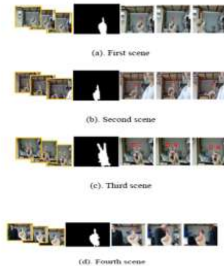
Figure 3: Fingertip Detection Result