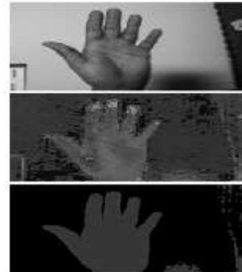
Figure 2: Fingertip Detection Steps

Skin detection process has two stages: a training phase and a recognition phase. Training a skin detector involves three basic steps: