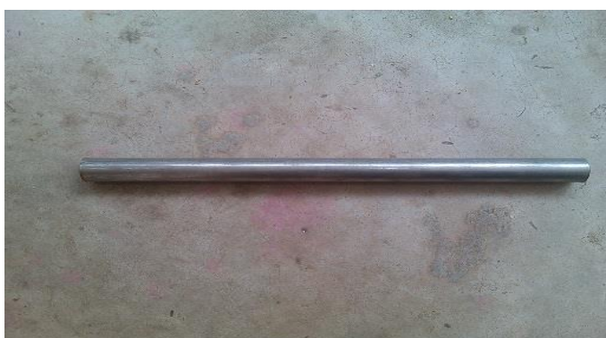
Fig:1.3 Stainless steel Metal having a length of 500mm and outer dia 33mm.