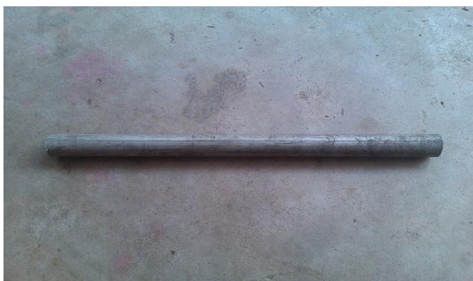
Fig 1.4 Al Metal having a Length of 500mm & OD is 38mm.