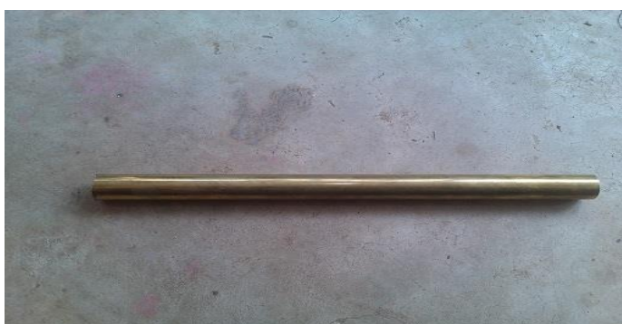
Fig.1.5 Brass Metal having length 500mm and OD is 38mm.