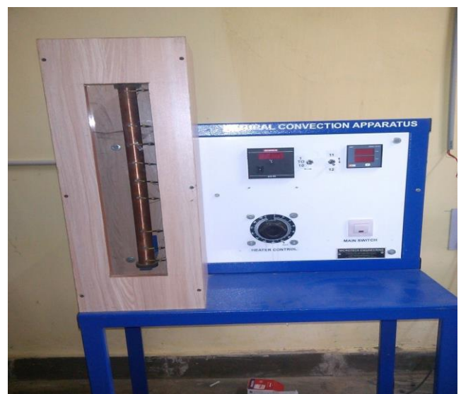
Fig. 1.1 Experimental setup at GEC Jagdalpur