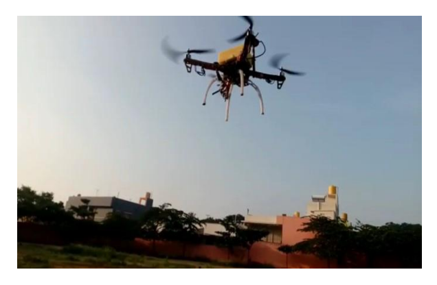
Fig -2: Autonomous Drone Flying

An autonomous drone using effective utilization of GPS mapping with flight controller has been developed.